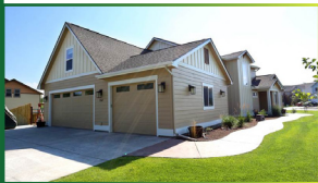
Edgell Building Inc.