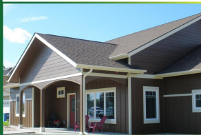
Earls Construction, Inc.